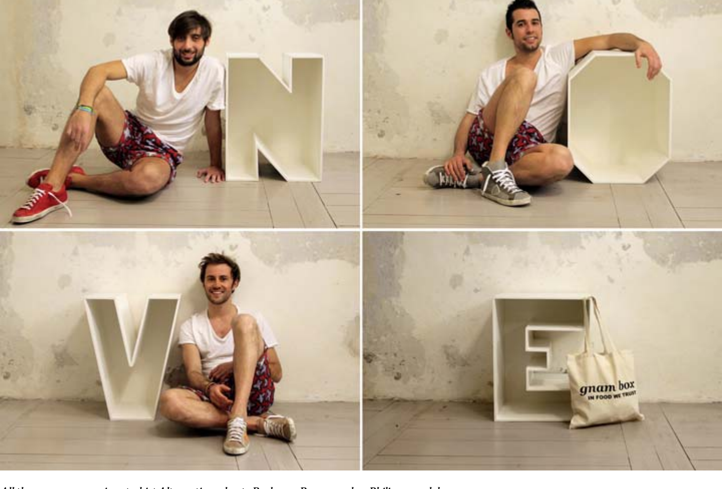
All the guys are wearing: t-shirt Alternative, shorts Burkman Bros, sneaker Philippe model